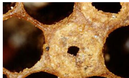
AFB infected brood cell showing perforated cell cap

If you are suspicious of an exotic disease or pest such as Varroa mite please contact the Plant Health Australia Pest Plant Hotline on 1800 084 881 or an Agriculture Victoria Apiary Officer immediately.