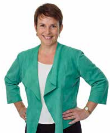
The Hon. Jaala Pulford MP

This four-year $20 million investment works towards a Victorian agriculture sector that is safe, empowered and innovative so that our industry and rural communities can thrive.