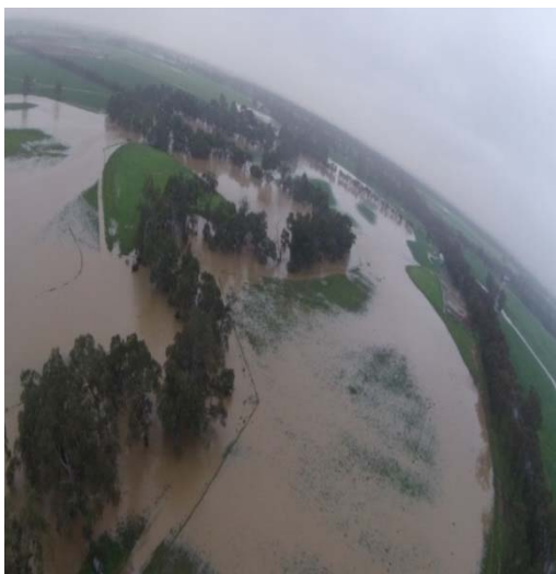
Photo: the Ipsen farm in flood with the SCAs visible on the right.

During the 2016 floods they provided a safe haven for sheep while their paddocks went under water.