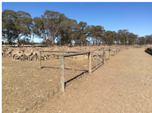
Photo: SCAs and adjacent feeding laneway.