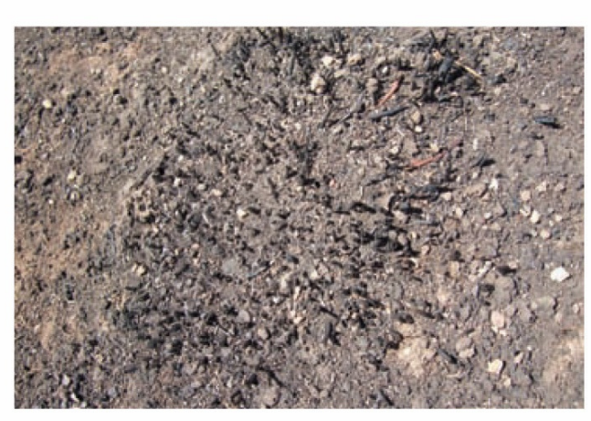
Close-up view of perennial plant effected by a hot burn. All dead material is burnt, perennial plant is blackened.