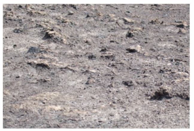
Very hot burn – no plant material visible, earth has a blackened, charred appearance.