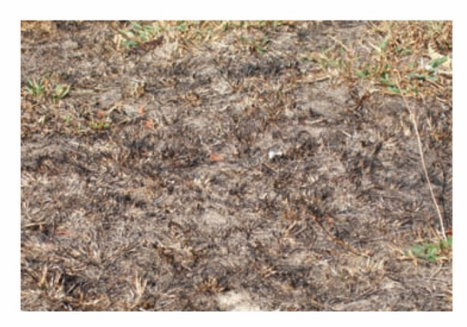
Cool-moderate burn – pasture is charred, but not completely blackened. Recent rains have initiated recovery of perennials.