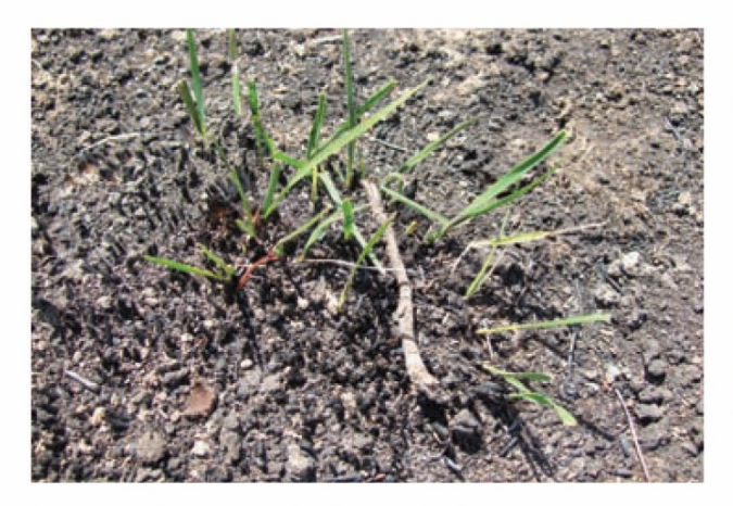
Perennial plant recovering from a hot burn.