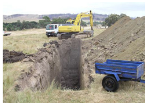
Figure 1: Example of on-farm trench burial.

The preferred equipment for constructing this type of pit is an excavator. During construction, topsoil should be separated from subsoil for later return to the top during pit closure. Excavated material should be stored along one side or at the ends of the pit, depending on the operation. Surplus soil should be heaped as overfill.