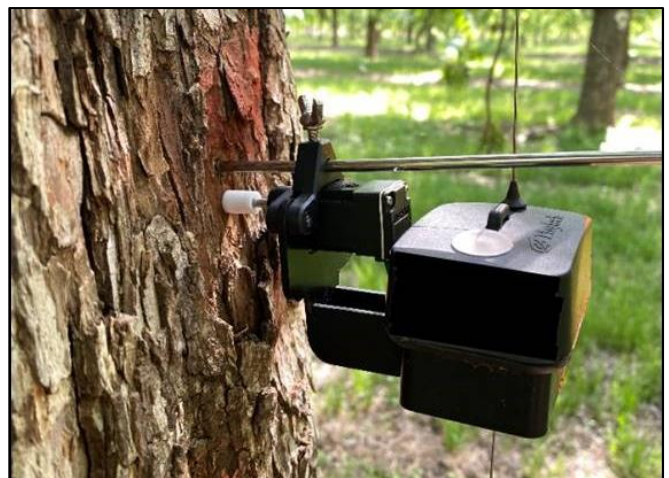
Figure 3. Wireless dendrometer on mature pecan tree.

Daily patterns in water use cause plants to shrink and swell throughout a 24-hour period. As plants transpire during the day, water is mobilised from storages in plant tissue and transported to the leaves through the sapwood. As this occurs, the trunk or stem shrinks. When transpiration reduces or ceases overnight, water continues to enter the plant through the root system (provided there is enough water available) and redistributes through the plant causing the tissue to swell.