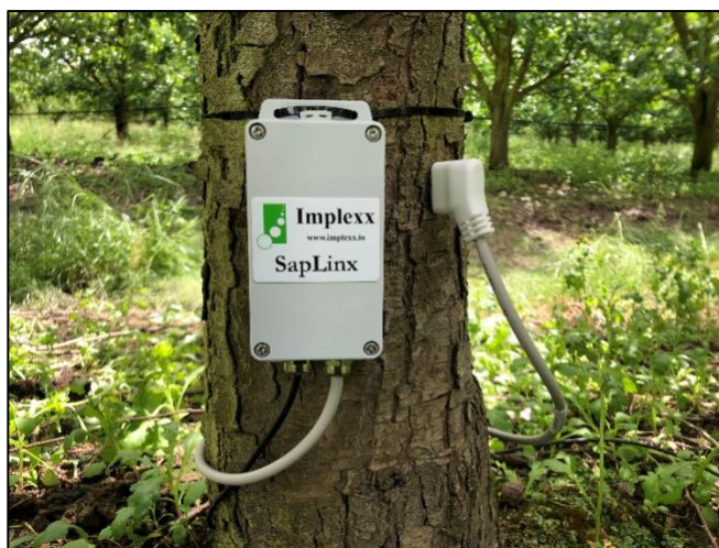
Figure 1. Sap flow sensor probe (right) and data logger on a pear tree.

Sensors use a heater probe to measure the velocity of fluid moving through the stem.