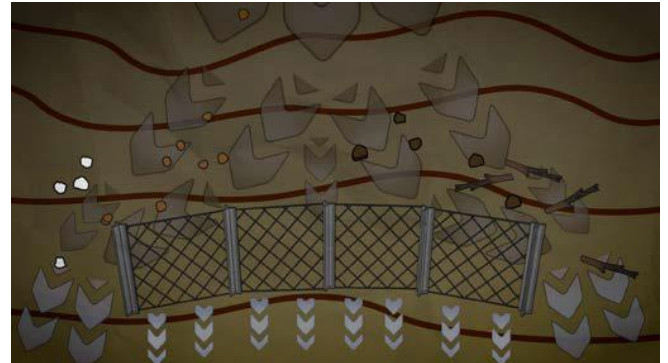
Figure 2 Ensure that the fence line curves downwards at each end so water slows and goes around the fence.

Materials can include star posts and wire salvaged from fire-damaged fences, along with straw, shade cloth or other readily available items.