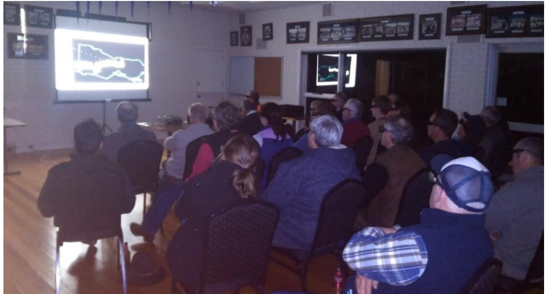
Smeaton BestWool/BestLamb Group, wearing 3D glasses for a mining and minerals meeting, Creswick, 2019