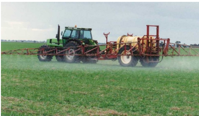
Figure 1 Chemical application in action