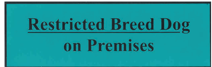
Figure 2. Example warning sign

For details of suppliers of restricted breed dog signs, contact your local council, or phone the DEDJTR Customer Service Centre on 136 186.