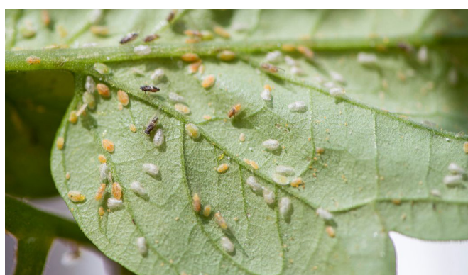
Figure 5: TPP adults and juveniles on the underside of a leaf