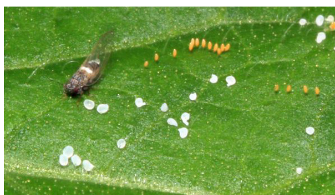
Figure 1: TPP adult and eggs on leaf. White substance is honeydew (sugar-like granules) excreted by TPP