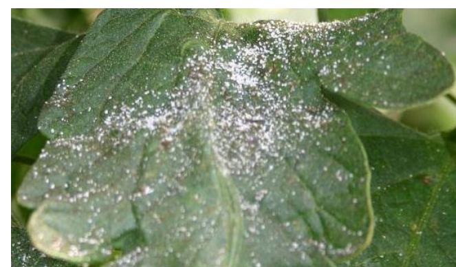
Figure 6: Honeydew (sugar-like granules) excreted by TPP (Department of Primary Industries and Regional Development, Western Australia)