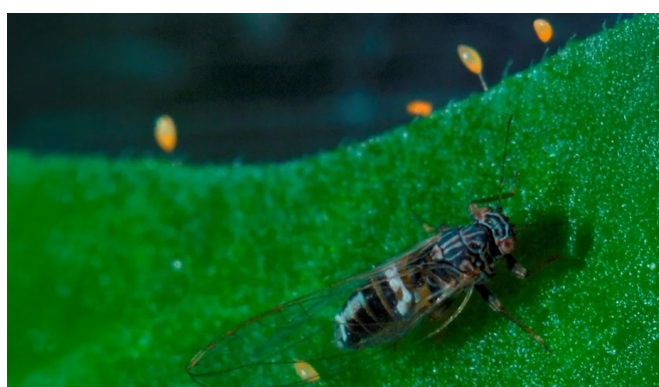
Figure 2: TPP adult and eggs showing egg stalks from side of leaf (New Zealand Plant and Food)