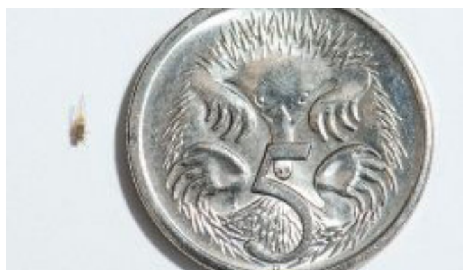
Figure 4: TPP size relative to 5 cent piece (Department of Primary Industries and Regional Development, Western Australia)