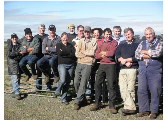
Campaspe Lamb Producers Group