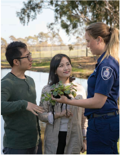
ທ່ານສາມາດຊ່ວຍພວກເຮົາຢຸດຍ້ອງມີໄຟໄດ້ ໃຫ້ຫຍ້າຊະນິດນີ້ ເຂົ້າມາແຊກແຊງສິ່ງແວດລ້ອມ.

ຕິດຕໍ່ຫາພວກເຮົາ ຈົ່ງແຈ້ງໃຫ້ເຮົາຊາບຖ້າທ່ານເຫັນຜັກຕົບຢູ່ໃນແມ່ນໍ້າ, ບຶງ ຫຼື ລ່າທານໃນເຂດທ້ອງຖິ່ນຂອງທ່ານ ເພື່ອວ່າເຮົາຈະໄດ້ໄປຮີ້ອອກແລະຊ່ວຍປ້ອງກັນສິ່ງແວດລ້ອມຂອງອອສຕຣາລີ້ຍ.