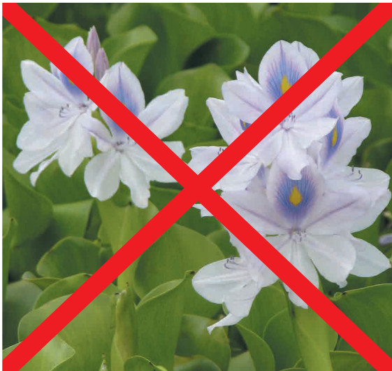
You are not allowed to buy or sell water hyacinth.

It stops people from enjoying activities such as fishing, kayaking and water skiing. In rivers, lakes and streams, it can increase costs to farmers and makes our food more expensive.