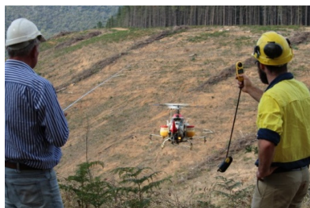
Remotely piloted aircraft (RPA) sprayer in operation

Keeping specified records is required by law for users of all agricultural chemicals in Victoria. Records must be made within 48 hours of use and kept for two years by the pilot. The land manager may ask the pilot for a copy of the record.