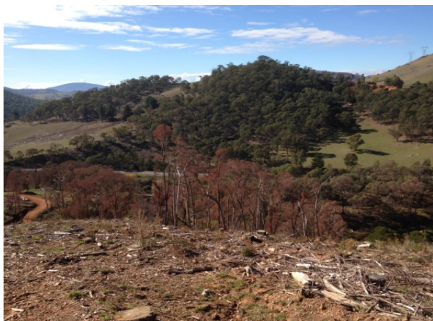
Spray drift damage to native vegetation in unacceptable

Good communication with neighbours before spraying can help to prevent misunderstandings and potential problems.