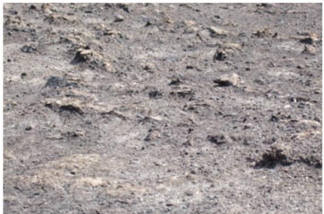
Very hot burn – no plant material visible, earth has a blackened, charred appearance.