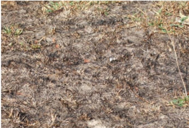
Cool-moderate burn – pasture is charred, but not completely blackened. Recent rains have initiated recovery of perennials.