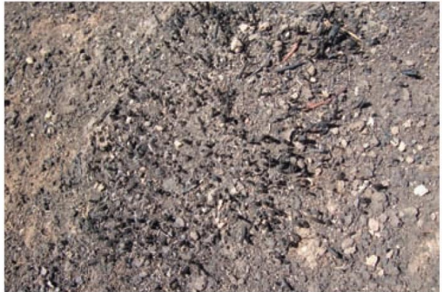
Close-up view of perennial plant effected by a hot burn. All dead material is burnt, perennial plant is blackened.