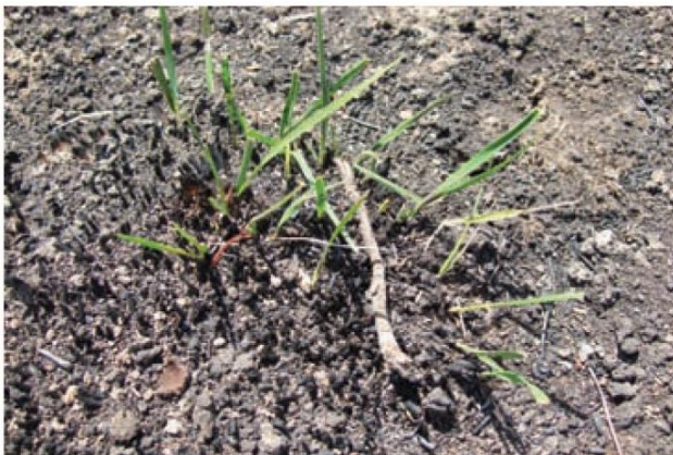
Perennial plant recovering from a hot burn.